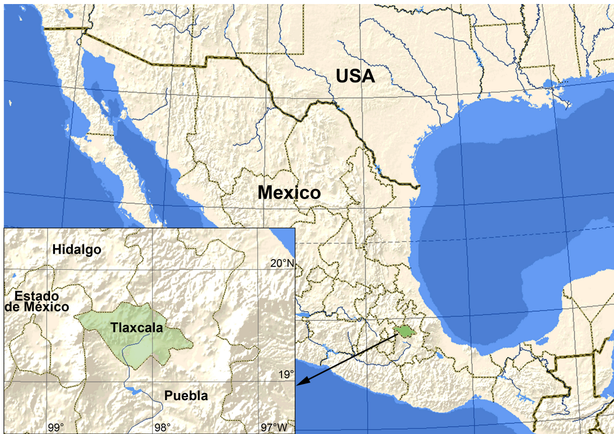
Fig. 1. Geographical location of the state of Tlaxcala, Mexico. Рис. 1. Географическое положение штата Тлакскала, Мексика.

ZISP – Zoological Institute of the Russian Academy of Science (St. Petersburg, Russia).