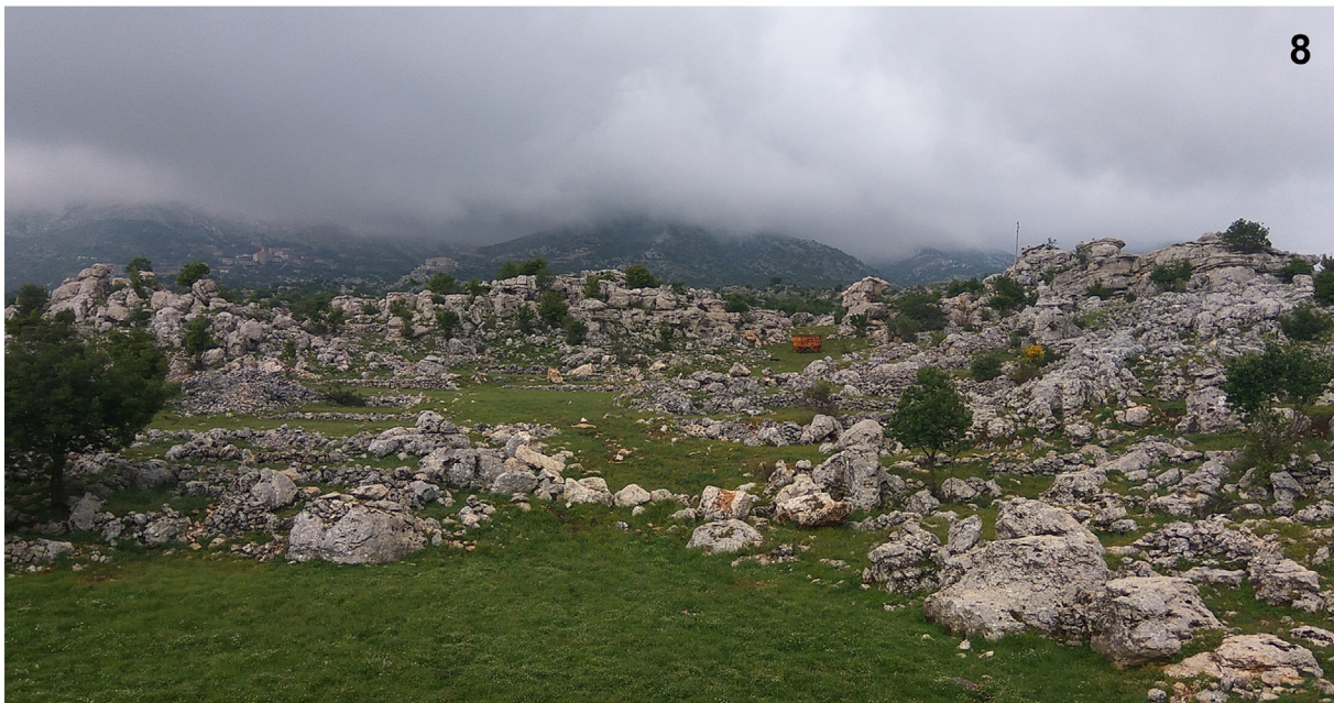
Figs 7–8. Habitats of Brachycerus in Lebanon.

7 – Bekaa, Kornet-el-Jamal Mt., habitat of B. hermoniacus Friedman et Sagin, 2010 and B. argillaceus Reiche et Saulcy, 1858; 8 – near Jezzine, habitat of B. junix Olivier, 1807.