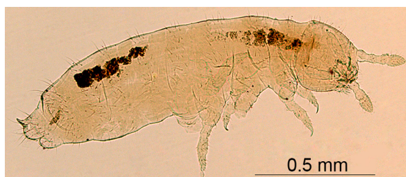
Fig. 1. Habitus of Heteraphorura iranica from Kolkheti Lowland, Georgia.

Рис. 1. Габитус Heteraphorura iranica с Колхидской низменности, Грузия.