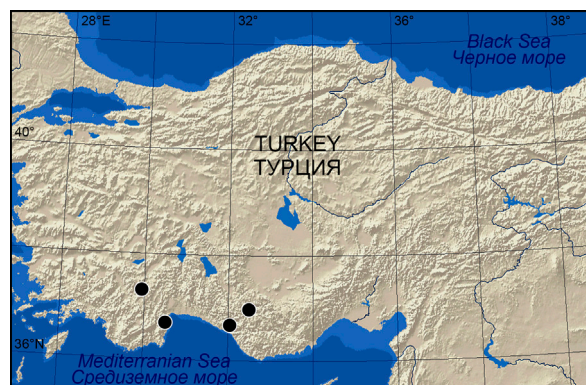
Fig. 16. Distribution map of Zodarion barbarae in Turkey.

Yu.M. Marusik, M. Kovblyuk and İ. Coşar are thanked for improving manuscript. English of the final draft was kindly checked and corrected by V. Fet. We thank the