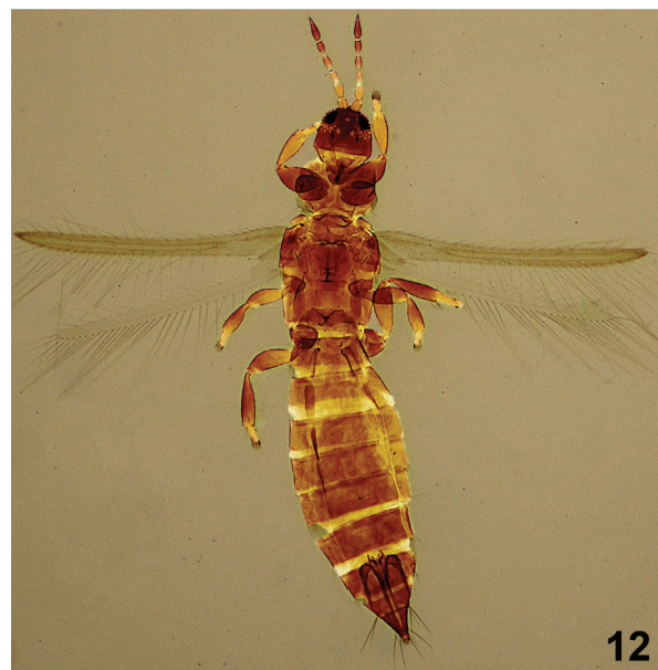
Figs 11–12. Species of the genus Thrips , habitus.

Рис. 11–12. Виды рода Thrips , общий вид.