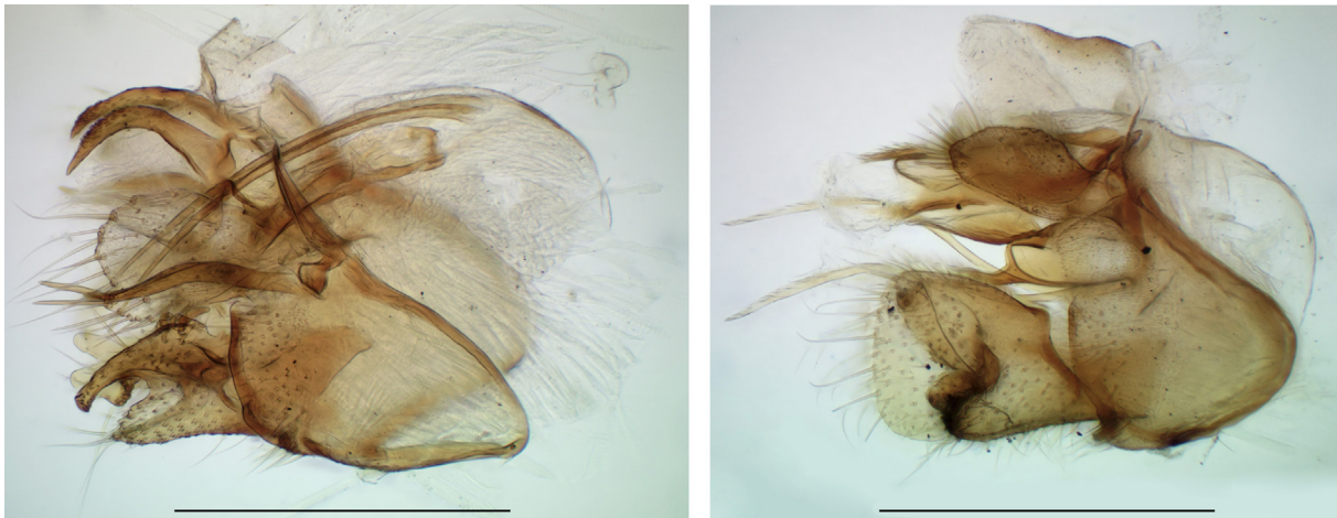
Figs 3–4. Plectrocnemia spp., male genital structures, lateral view. Scale bar 0.5 mm.

Рис. 3–4. Plectrocnemia spp., генитальные структуры самца, вид сбоку. Масштабная линейка 0.5 мм. 3 – P. kusnezovi Martynov, 1934; 4 – P. wui (Ulmer, 1932).