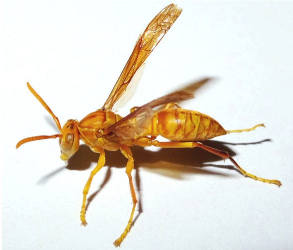
Fig. 2. Polistes wattii from Aybak District, Afghanistan.

Рис. 2. Polistes wattii , Айбак, Афганистан.