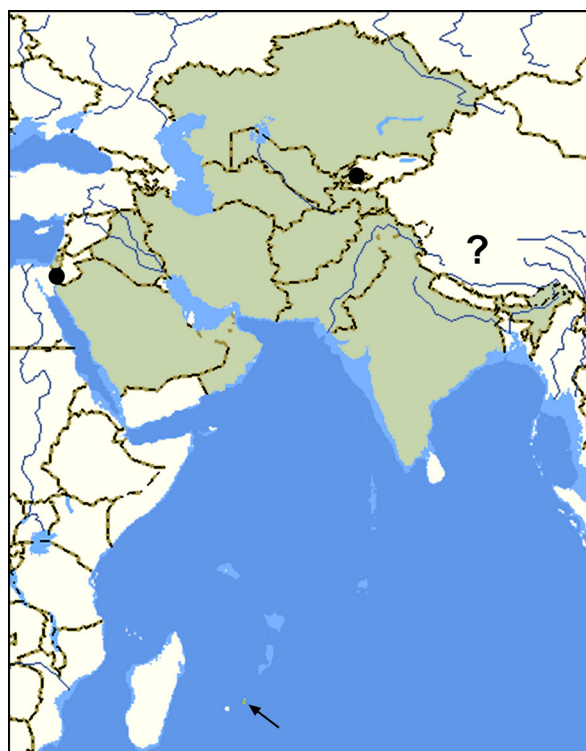
Fig. 1. Countries for which Polistes wattii is reliably recorded. Question mark is due to the lack of precise localities in China, for which only a generic “S China” is reported. Arrow shows Mauritius. Circles mark the countries added by this work.

Polistes (Gyrostoma) wattii Cameron, 1900 is a temperate species of paper wasp nesting in cavities of trees or human building [Temreshev, 2018]. It is widespread in almost all central south Asia: Das and Gupta [1989] and Carpenter [1996] synthesized the faunistic knowledge of this wasp reporting overall the following countries in which it was known: Saudi Arabia, United Arab Emirates,