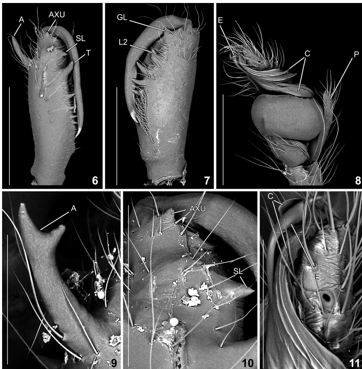
Figs 6–11. Scanning electron micrographs of Tetragnatha reimoseri .

6 – male chelicera, dorsally; 7 – female chelicera, ventrally; 8 – male palp; 9 – dorsal apophysis of male chelicera (A); 10 – distal part of male chelicera, dorsally; 11 – tip of palp. A – male dorsal apophysis; AXU – auxiliary guide tooth of the upper row of chelicera; C – conductor; E – embolus; P – paracymbium; SL – a tooth tilted towards the base of the segment; T – elongated tooth in the upper row of male chelicera; GL – guide tooth of the lower row of chelicera; L2 – a tooth on the lower row of chelicera after GL. Scale bars: 6–7 – 1 mm, 8, 10 – 0.5 mm, 9 – 0.3 mm, 11 – 0.2 mm.